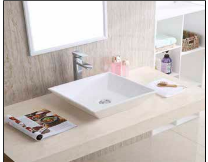
Installed Product Image

Please note: All porcelain sinks are fired at a very high temperature; final dimensions may vary slightly.