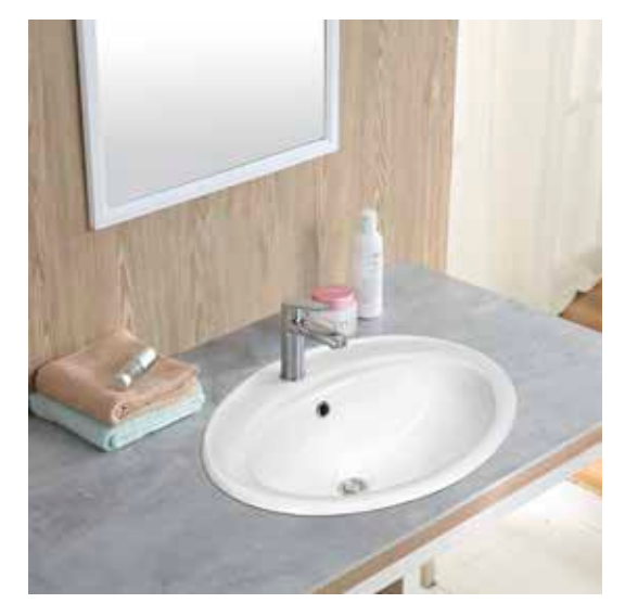
Installed Product Image

Please note: All porcelain sinks are fired at a very high temperature; final dimensions may vary slightly.