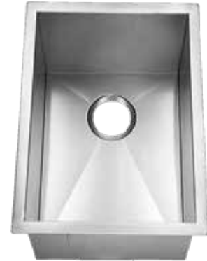
Shown with “Zero-Edge” corners