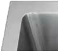
R15mm “Radial” Corner Detail