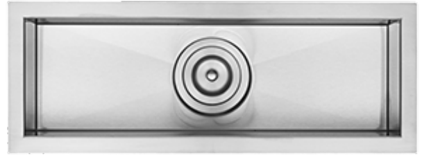
Shown with “Zero-Edge” corners