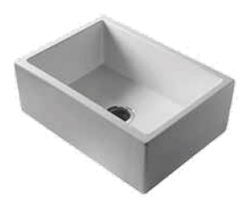
Dimensions Outer: 29-3/4" x 18" x 10" Inner: 26-3/4" x 15" x 8-1/2"