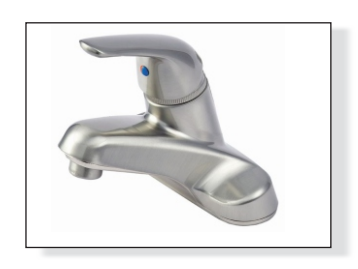
Model Number: WL-L-210100-CP WL-L-210100-SN

Please read carefully before installation.