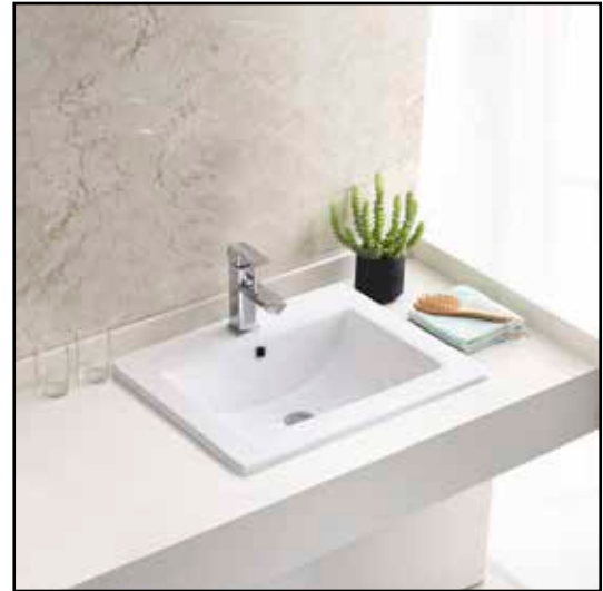
Installed Product Image

Please note: All porcelain sinks are fired at a very high temperature; final dimensions may vary slightly.