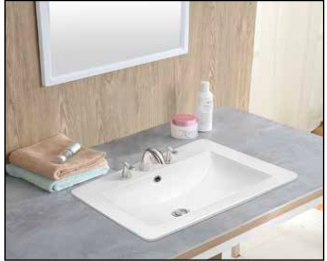
Installed Product Image

Please note: All porcelain sinks are fired at a very high temperature; final dimensions may vary slightly.