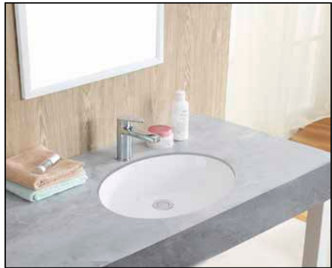
Installed Product Image