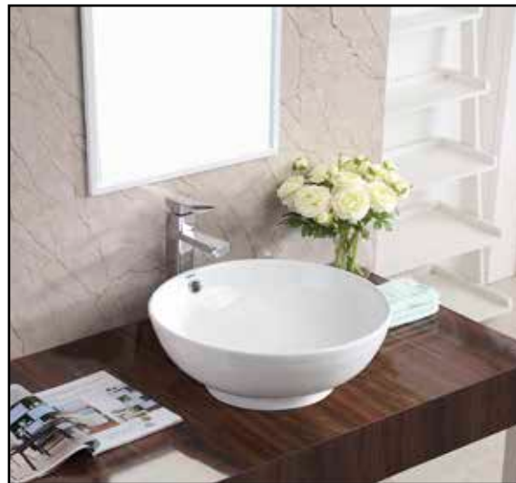
Installed Product Image

Please note: All porcelain sinks are fired at a very high temperature; final dimensions may vary slightly.