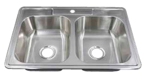
(1-Hole Configuration Shown)