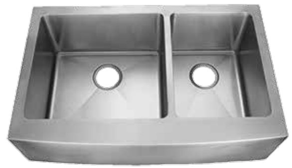
Shown with "Radial" corners

--- Dimensions --Outer 35-7/8" x 20-3/4" x 10" Left Bowl 19" x 16" x 10" Right Bowl 13" x 16" x 10"