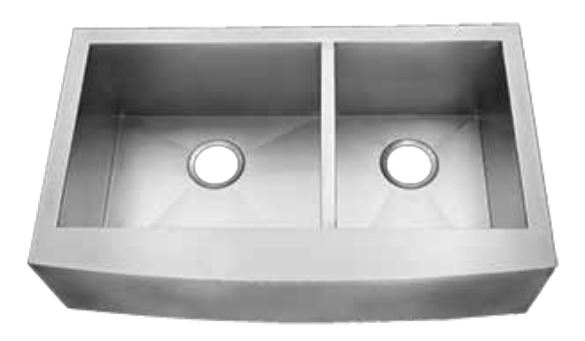
Shown with "Zero-Edge" corners

--- Dimensions --Outer 32-7/8" x 20-3/4" x 10" Left Bowl 17-3/8" x 16" x 10" Right Bowl 11-3/4" x 16" x 10"