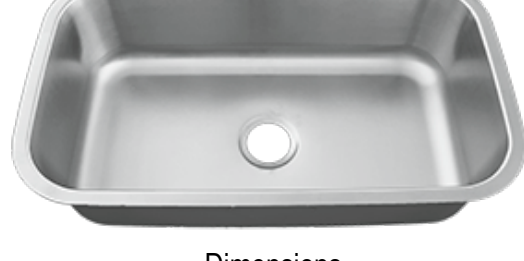
--- Dimensions ---Outer 31-1/2" x 18-1/4" x 9" Inner 29-1/2" x 16-3/8" x 9"