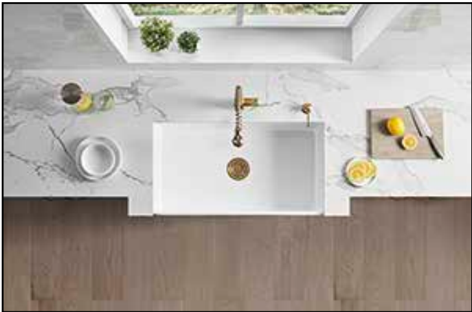
Installed Product Images