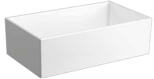
Shown with White Finish

Dimensions Outer: 33" x 19" x 10" Inner: 31" x 17" x 9"