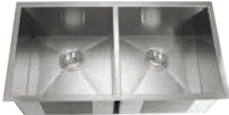
LI-2000 "Zero-Edge" LI-2000-R "Radial"

"Zero Radius" "Rounded Corner" Most Farmhouse models include a Colander, Drain and Grid (two grids for double-bowl models).