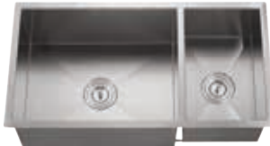
LI-2100 "Zero-Edge" LI-2100-R "Radial"