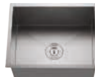
LI-2900 "Zero-Edge" LI-2900-R "Radial"