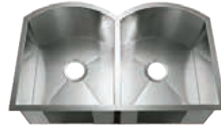
LI-2200-S "Zero Edge" Only