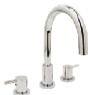
Vanity Wide Spread (8")